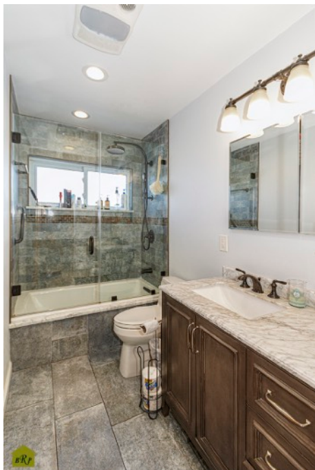
• Garden Level